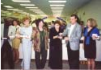
Ribbon Cutting with Board of Trustees

On August 1, 2001, the North Las Vegas Library District opened the doors of its new Northwest