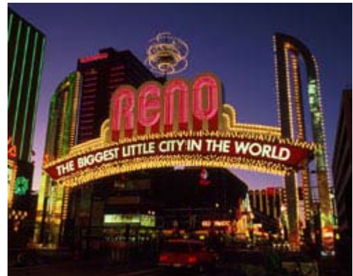
NLA Conference 2005 Free Minds, Free People!