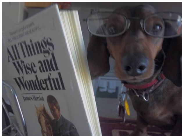
Simon, the dachshund, was the winner in the youth (0-12 years) category.

Winners received a "READ" poster of their photograph along with their pet's name displayed on a bookplate in an animal book about the winning animal's type.