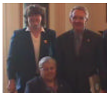
With Senator Reid

The purpose of the workshop is to prepare library representatives to meet with their elected delegations the next day. Successful meetings were held with Senators Reid and Ensign. They