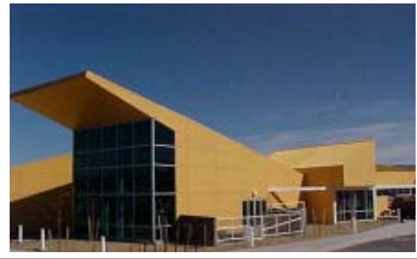
Washoe County New South Valleys Library