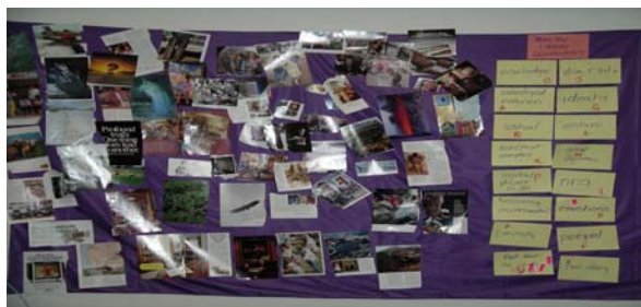
The Magic Wall ...

I am grateful to the Nevada State Library and Archives, with funding from the Library Services and Technology Act, and the Institute of Museums and Library Services for providing The 6 th Annual Library Institute.