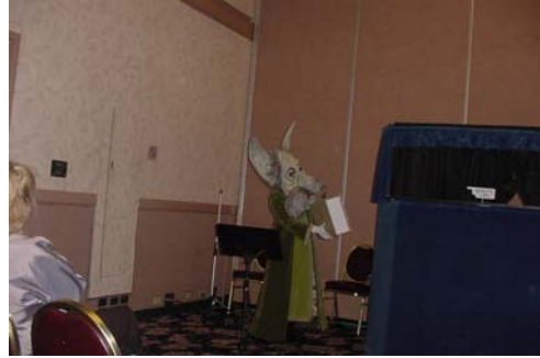
show - one with puppets and one with a dragon reading the story.

Following these serious discussions, by Phil Fickes, magician and puppeteer from Ely, performed magic tricks school librarians could do with their pupils and then presented two version of a "Magic of Reading"