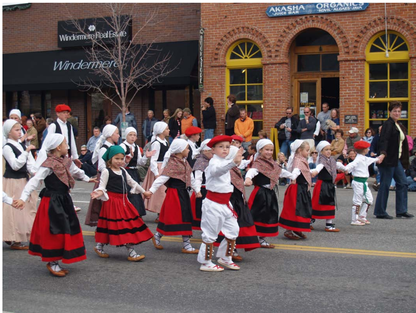
Researchers come to the UNR Basque Library to study the vibrant Basque Culture.