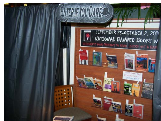
Banned Books display at Spanish Springs Library. The library kept the display up for the entire month of September.