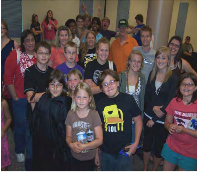
Spanish Springs Harry Potter fans

Spanish Springs Library had a Harry Potter Movie Marathon each Wednesday from June 1-July 13, showing the movies in order from "The Sorcerer's Stone" to "The Deathly Hallows, Part 1." The film series drew 278 participants, and garnered a lot of enthusiasm—and smiles.