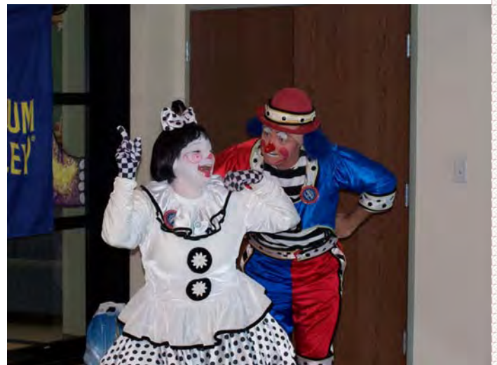
Submitted by Bonnie Saviers

They entertained the crowds with juggling, magic, humor, clown noses and coloring pages, all the while making references to reading and what kinds of books are available in the library.