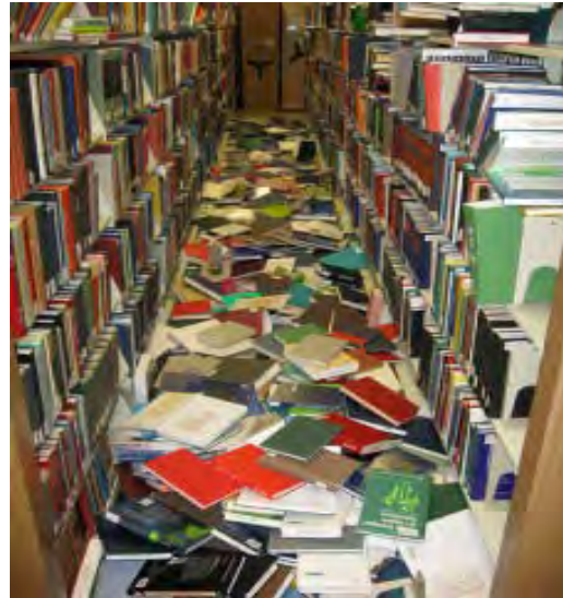
Fallen books fill the floor of the McKeldin library after the quake.

just over 24 hours after the quake, all the books were on carts, ready to be evaluated and sorted. Workers separated damaged books from those ready to be re-shelved. Great people work in libraries.”