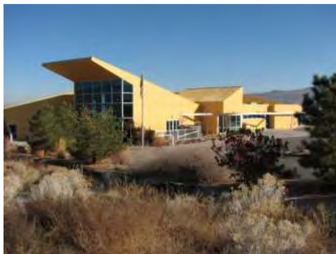
South Valleys Library