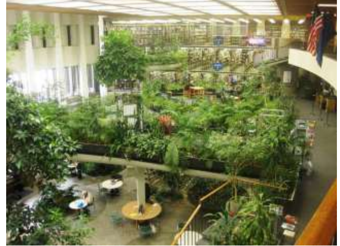
Because of its unique architecture and landscaping, Technology Services Librarian Marc Tiar felt inspired to enter the Downtown Reno Library into a national contest sponsored by Gale/Cengage for the "Most Beautiful Library." One of the categories was for "Coolest Internal Space" which seemed providential for the garden-like atmosphere.

Given the Downtown Reno Library's exterior angled glass and copper panels, its internal space is a refreshing surprise. Green trees rise from floor to ceiling, offering patrons a peaceful reception into an atrium-like setting, filled with leafy plants and the gentle murmur of water from a fountain on the garden level.