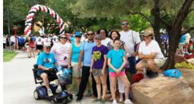
Team Library stepped up for the 2014 AIDS walk in Las Vegas, with 14 walkers raising over $1100 for the charity.