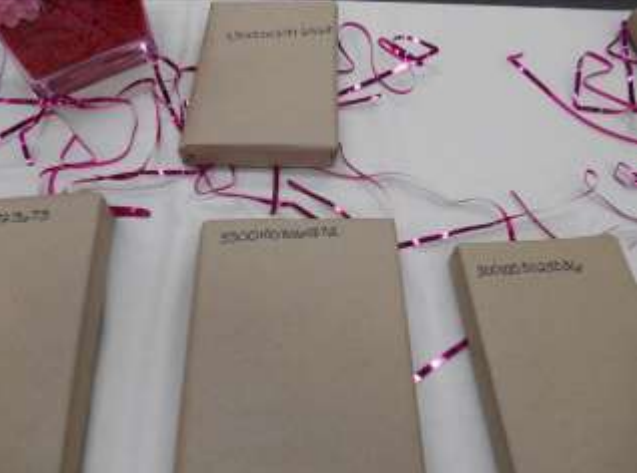
Blind date prospects, with their barcodes written on the wrapper.

Do you have a sense of adventure? The Elko County Library is offering <u>Blind Date with a</u> <u>Book.</u> This program was started in February of 2013 to see if patrons would read genres that they were not familiar with. It was a big success, and we decided to bring it back. Patrons have said things like: "I would never have read the book I read if I was choosing it from the shelf!" "This is one of the best programs I have ever taken part in." "The library should do this once a month."