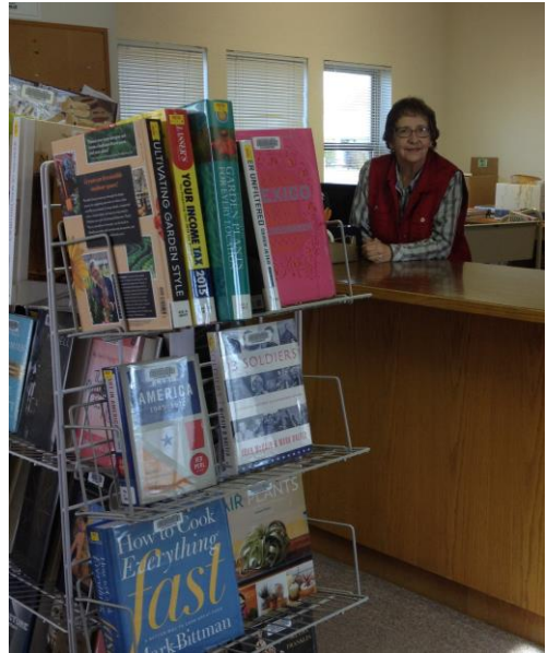
At the Annex: Service with a smile

Library services have relocated to the Library Annex at the north end of the property. Available are selected backlist titles, dvds, books on cd, new material, and internet access. Additionally, our CLAN neighbors are continuing to loan their material to Churchill County patrons.